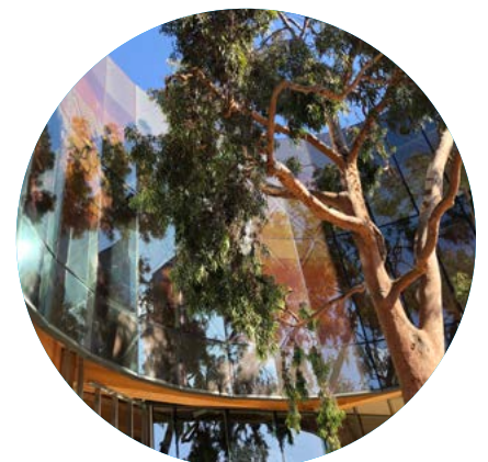
Façade cut-out surrounding the lemon scented gum on Mundy Street