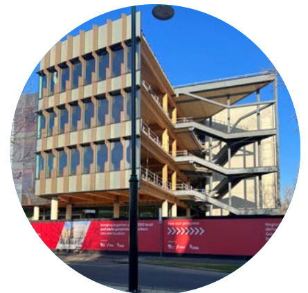
The feature staircase on the corner of Lyttleton Terrace and St Andrews Avenue

We look forward to welcoming new tenants into the building in early 2023, and will share more on Galkangu’s progress as we near completion.