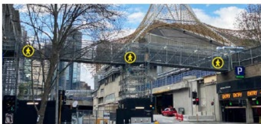
Above: the pedestrian bridge between Arts Centre Melbourne Forecourt and the Primrose Potter Australian Ballet Centre

Pedestrians are encouraged to use the pedestrian bridge between Arts Centre Melbourne Forecourt and the Primrose Potter Australian Ballet Centre (PPABC). The pedestrian bridge is accessible between 6am and 1am Monday to Saturday, and 9am to 11pm on Sunday. To access this bridge from Kavanagh Street, you can enter the PPABC building, take the lift to the fourth floor and cross the bridge to Arts Centre Melbourne and NGV.