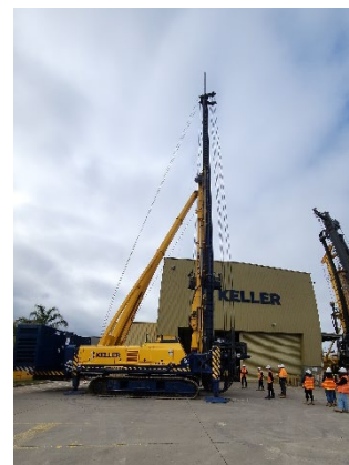
Above: one of the piling rigs that will be arriving on site

Each piling rig will be delivered overnight onto site and will be built over three to four days. Once completed, they will stand at approximately 40 metres high. That's 15 metres taller than the Primrose Potter Australian Ballet Centre!