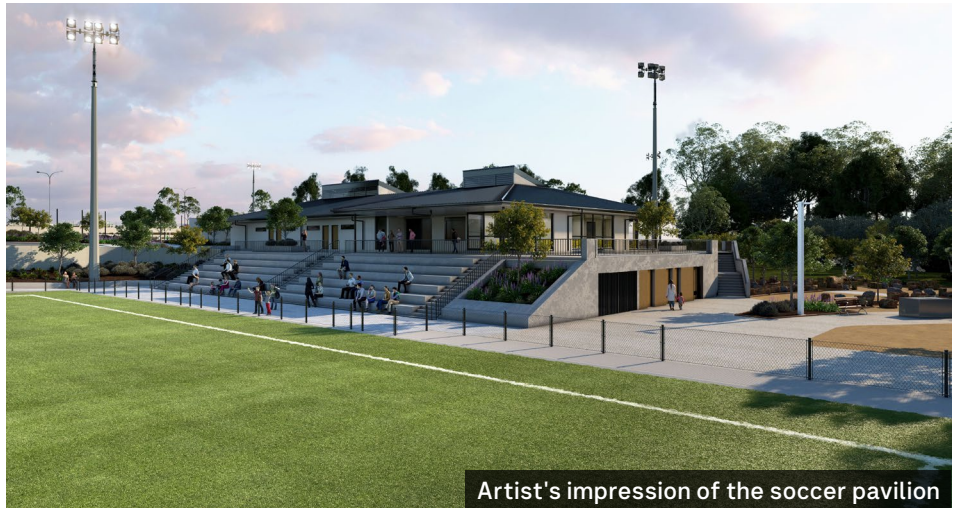
Artist's impression of the soccer pavilion

Areas identified as home to threatened fauna species will be protected and not impacted by the final design or construction.