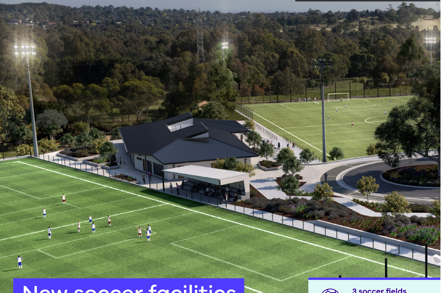
Artist's impression of the soccer facilities