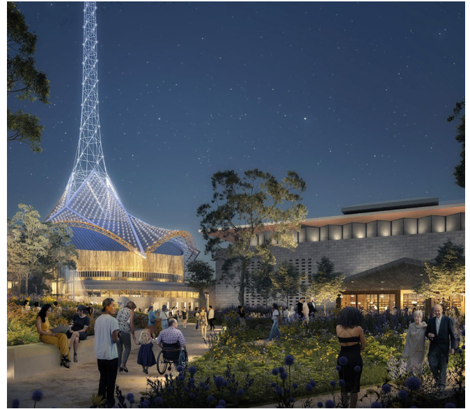
Artist render of Melbourne Arts Precinct urban garden

We are working with the Traditional Owners of the land upon which the project sits, the Wurundjeri Woi-wurrung people, as we develop the mix of planting that will be selected to inhabit and thrive in the urban garden.