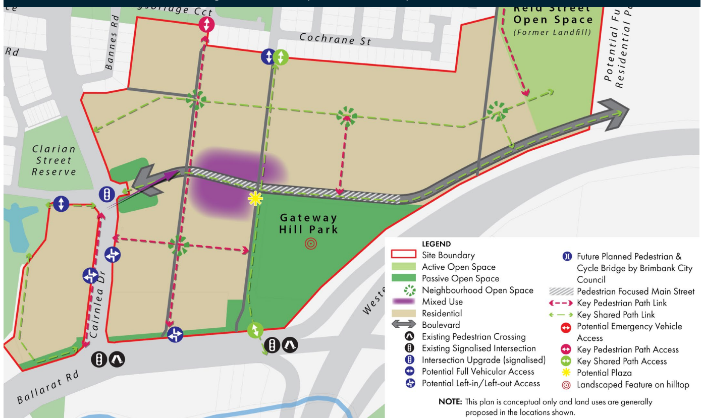
Figure 1: Draft Comprehensive Development Plan (CDP)

For more information visit Development.vic.gov.au/cairnlea