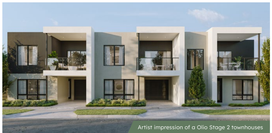
Artist impression of a Olio Stage 2 townhouses

A key feature of Stage 2 is our Priority Access program which offers eligible moderate-income earners an opportunity to buy homes before they're made available to the general public - with several purchasers already taking up this offer.