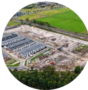
An aerial view of civil works on Stage 2

There may be some noise and dust associated with the civil works. We are working closely with our contractor to limit impacts as much as possible and thank you for your patience and understanding as the works are carried out.