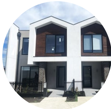
Stage 1 completed townhouse

We are also continuing to improve streetscapes around the area, with grassing and mulching of nature strips, general street cleaning and maintenance, and new tree planting taking place throughout the area.