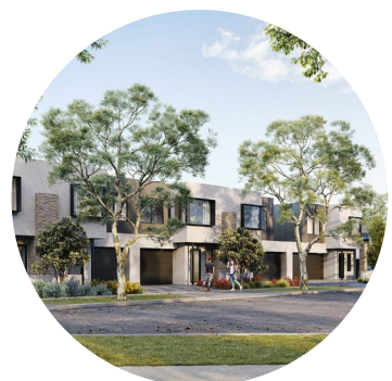
Artist impression of Stage 2 homes at Olio