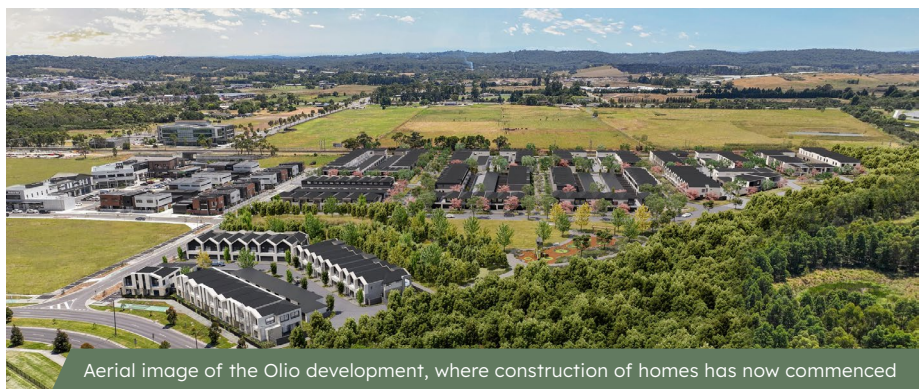
Aerial image of the Olio development, where construction of homes has now commenced

We recently reopened our Olio Display Suite and commenced sales of Stage 2, which comprises of over 100 homes – all within walking distance to Gum Scrub Creek, Officer Train Station, the new One Centre Square Officer and the future Olio Park.