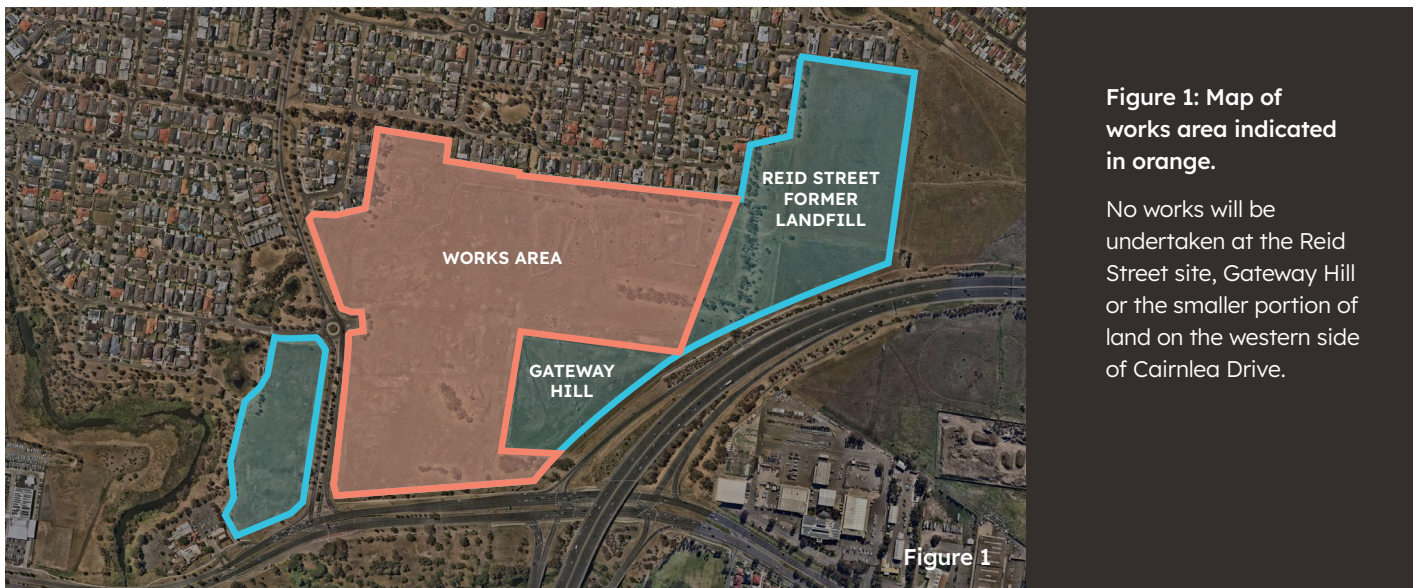
Figure 1: Map of works area indicated in orange.

In December 2024 Development Victoria will be undertaking remediation works to ensure the final stage of Cairnlea is ready for a future residential community.